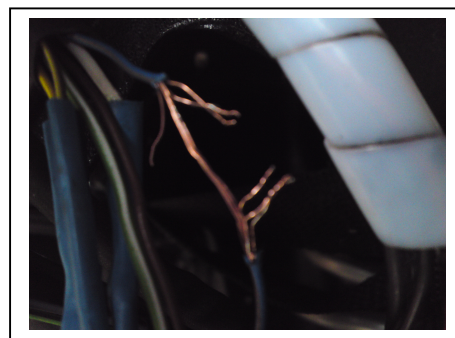
Fourth wire after stripping covering