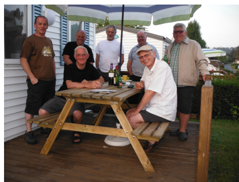
Chilling Out at the Campsite

Day 2 – Sunday 15 th June. ARROMANCHE – GOLD BEACH. We explored our host town then headed to the beach and had a look at the remnants of the Caissons (concrete breakwater sections) and Mulberry harbour. These have been left on the beach and in the sea as a reminder of the events following D-Day. From here we walked up the hill to the 360° CinemaCirculaire. The top of the hill offers panoramic views of Arromanche and Gold Beach. You can also see very clearly the 8km stretch of coast which the Mulberry Harbour was built in.