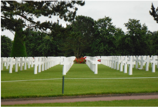
The American Cemetery

from the coast over the next few days. Approximately 2 km in from the coast some rangers found the guns from Pont Du Hoc hidden in bushes, but set up ready to fire out to sea, with a pile of ammunition, ready to use. The rangers made the guns inoperable and continued their advance inland. After Pont Du Hoc we headed back east along the coast to Omaha Beach. This seemed a desolate area and there wasn't much to see, although this area suffered the heaviest losses of the D-Day landings. From here we headed back towards Arromanche and stopped at the American War Cemetery, which was at Collevill-sur-Mer, on a cliff overlooking Omaha Beach and is the resting place for 9,000 Americans.