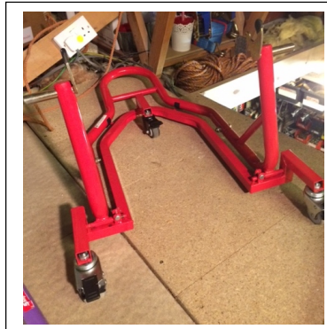
Bike Mover / Paddock Stand £40