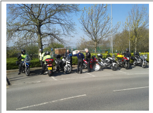
Ready for the 'off' in glorious sunshine

Hopefully all enjoyed the digs and the routes, if not Saturday's weather! Now I am off to clean my bike. See you all at the next clubnight.