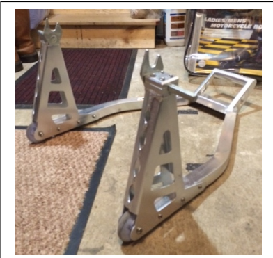
Alloy Paddock Stand £25

Pair of Wheels. Will fit Honda's – e.g. Firestorm, Blackbird and Hornet to name a few. Good condition £25. (No picture for these).