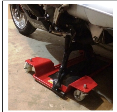
Bike Mover. Fits under Centrestand £25

Unmarried Couples Banned (as reported in the Independent Newspaper). Unmarried couples in Aceh, Indonesia will be banned from riding motorbikes together to protect against temptation towards “sinful acts”. Aceh is the country's most conservative region in following the Muslim faith. In 2013 women were banned from riding motorcycles by straddling behind mail drivers, instead they had to ride side-saddle. The new law banning unmarried couples will come into force in a year's time. (What happens if you want to carry your mother or sister?).