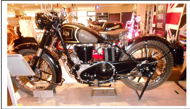
AJS with Oil Leak (as usual)