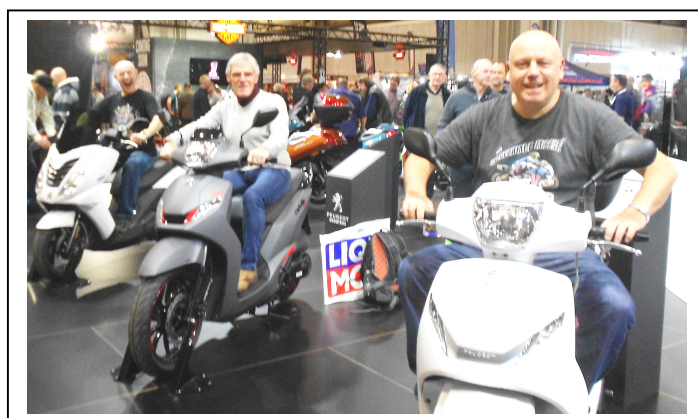
The Terrible Three took over the Peugeot stand but some loony took the No.3 slot and got us thrown off!